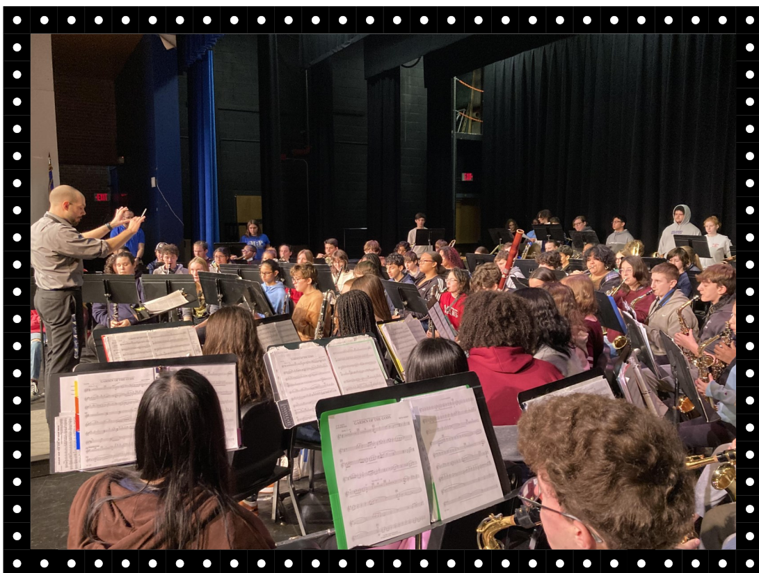
Current and former NEMS band students rehearsing together